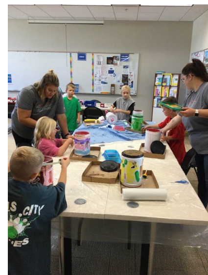
Making Piggybanks with the ladies from First Interstate Bank