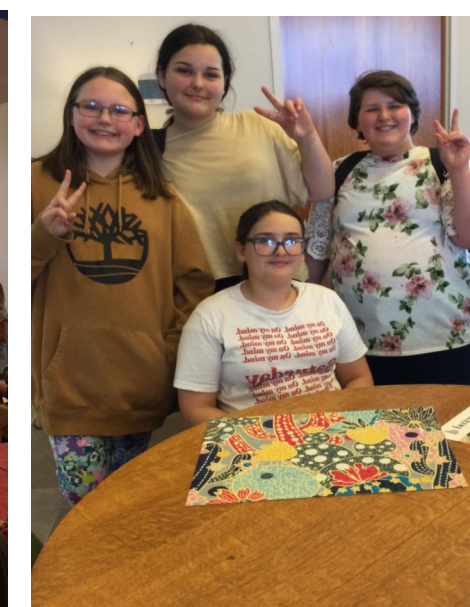
After school teens finish a puzzle.