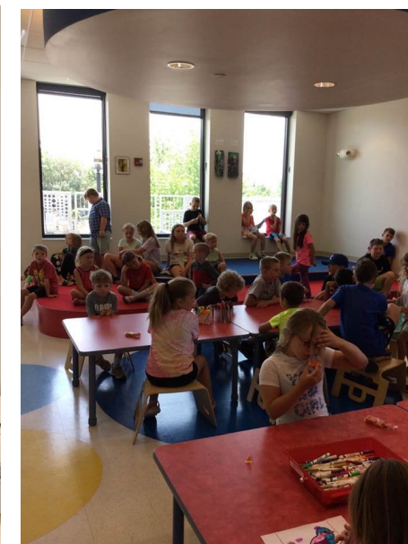
Summer Reading was a huge success this year. There was almost 50 kids at every program!